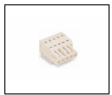
ELEGANTE SYSTEM LED gniazdo 3 polowe (388743)