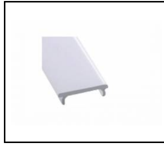
ELEGANTE SYSTEM LED klosz PC opal co-extrusion+soft fixing part 25m (388729)