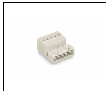
ELEGANTE SYSTEM LED wtyk 5 polowy (388774)