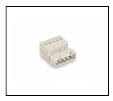
ELEGANTE SYSTEM LED wtyk 5 polowy (388774)