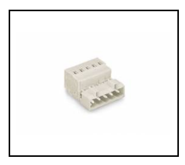
ELEGANTE SYSTEM LED wtyk 5 polowy (388774)