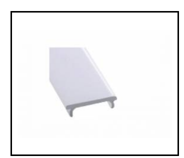
ELEGANTE SYSTEM LED klosz PC opal co-extrusion+soft fixing part 25m (388729)