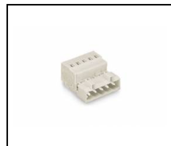
ELEGANTE SYSTEM LED wtyk 5 polowy (388774)