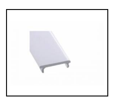
ELEGANTE SYSTEM LED klosz PC opal co-extrusion+soft fixing part 25m (388729)