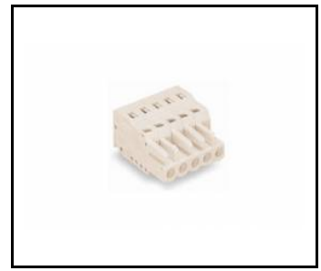
ELEGANTE SYSTEM LED gniazdo 5 polowe (388750)