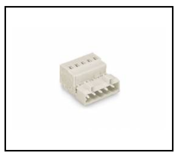
ELEGANTE SYSTEM LED wtyk 3 polowy (388767)