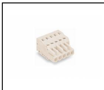
ELEGANTE SYSTEM LED gniazdo 5 polowe (388750)