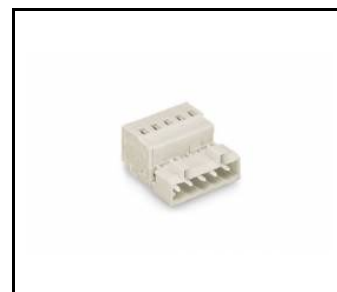
ELEGANTE SYSTEM LED wtyk 5 polowy (388774)