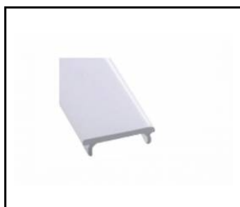
ELEGANTE SYSTEM LED klosz PC opal co-extrusion+soft fixing part 25m (388729)