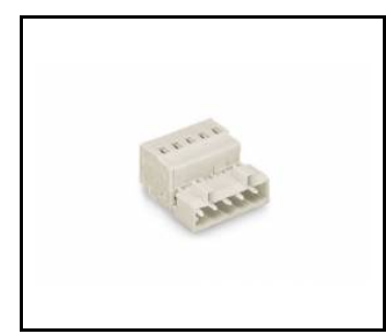
ELEGANTE SYSTEM LED wtyk 5 polowy (388774)