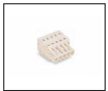
ELEGANTE SYSTEM LED gniazdo 3 polowe (388743)