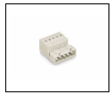
ELEGANTE SYSTEM LED wtyk 3 polowy (388767)