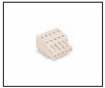
ELEGANTE SYSTEM LED gniazdo 5 polowe (388750)