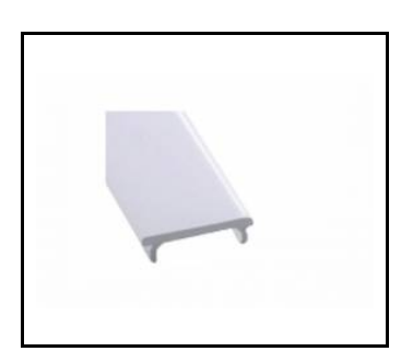
ELEGANTE SYSTEM LED klosz PC opal co-extrusion+soft fixing part 25m (388729)