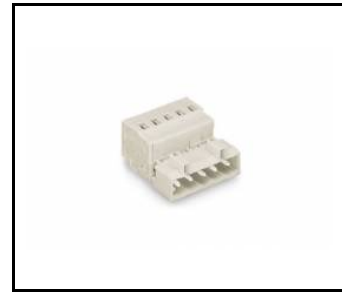
ELEGANTE SYSTEM LED wtyk 5 polowy (388774)