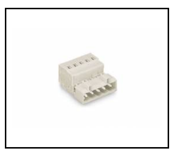
ELEGANTE SYSTEM LED wtyk 3 polowy (388767)