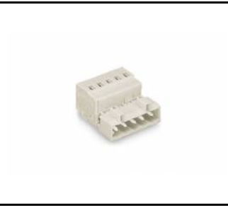
ELEGANTE SYSTEM LED wtyk 3 polowy (388767)