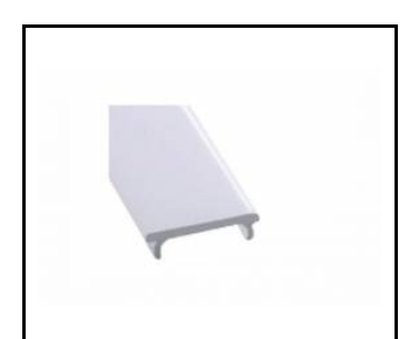
ELEGANTE SYSTEM LED klosz PC opal co-extrusion+soft fixing part 25m (388729)