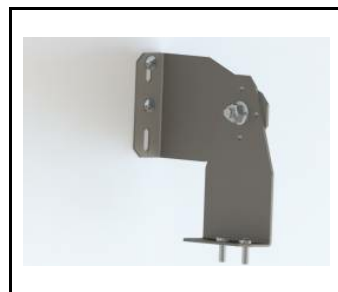
TYTAN LED. ATLAS LED. INDUSTRY LED - adjustable handle (set of 2) (908200)