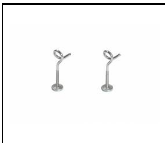
INDUSTRY LED suspension cord for chain (pack of 2) (541247)