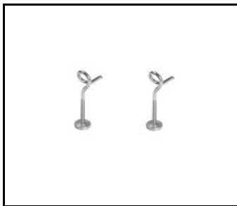
INDUSTRY LED suspension cord for chain (pack of 2) (541247)