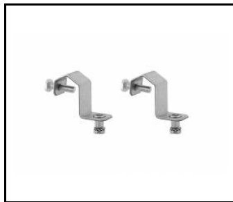
INDUSTRY LED pendant hook on wire (pack of 2) (543944)