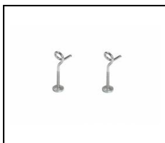
INDUSTRY LED suspension cord for chain (pack of 2) (541247)