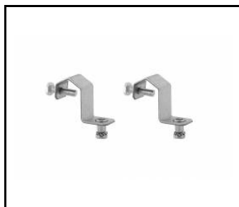
INDUSTRY LED pendant hook on wire (pack of 2) (543944)