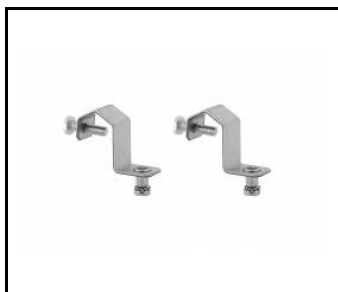
INDUSTRY LED pendant hook on wire (pack of 2) (543944)