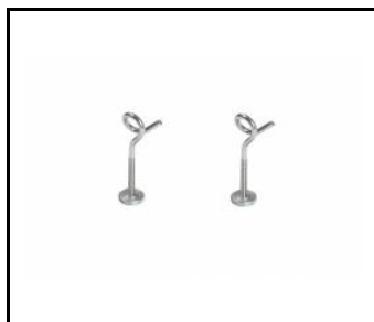
INDUSTRY LED suspension cord for chain (pack of 2) (541247)