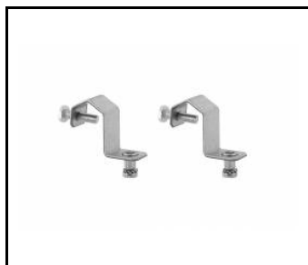
INDUSTRY LED pendant hook on wire (pack of 2) (543944)