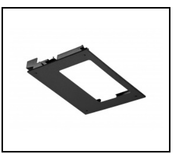
QUEST 2 LED L - recessed frame (699986)