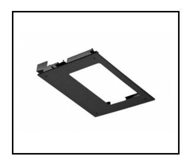
QUEST 2 LED M - recessed frame (699993)