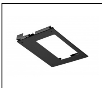
QUEST 2 LED L - surface frame (699986)