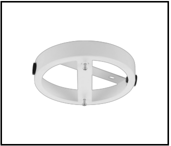
DOT CS galvanized steel arm (545672)