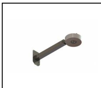
DOT CS galvanized steel arm (545672)