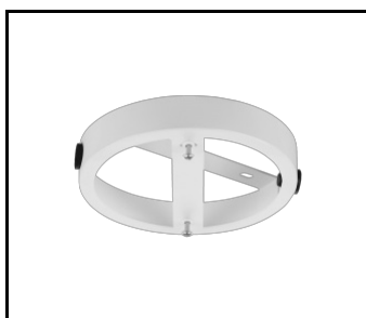
Ceiling spacer DOT white matt (551161)