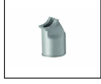
wall holder (galvanized) (314049) wall holder (grey) (314056)