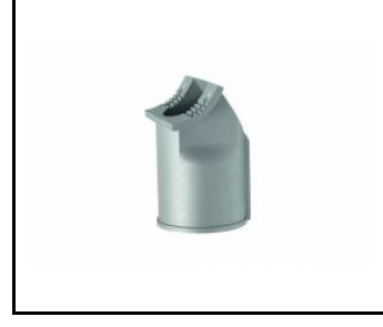
mounting grip 78 mm TIARA LED (UL00184)