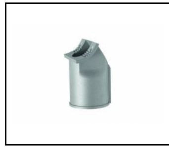
mounting grip 78 mm TIARA LED (UL00184)