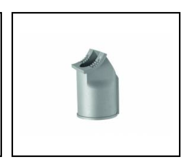
wall holder (galvanized) (314049)