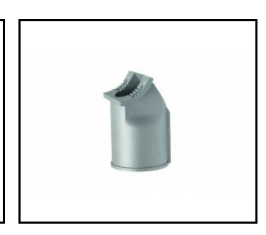
wall holder (galvanized) (314049)