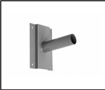
wall holder (grey) (314056)