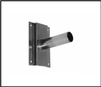
wall holder (galvanized) (314049)