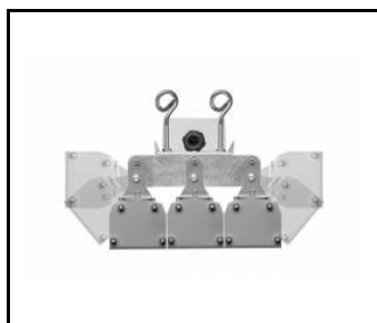
INDUSTRY IP66 LED MR 2