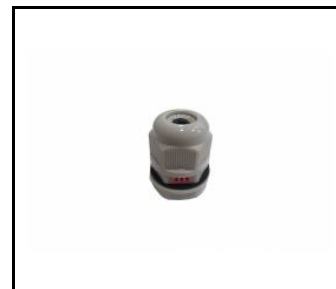
Breathable gland gray M20*1.5 IP68 (16000507)