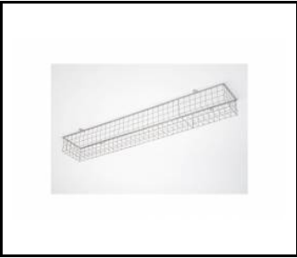
TYTAN LED. ATLAS LED - protective grid 1432mm (907920)