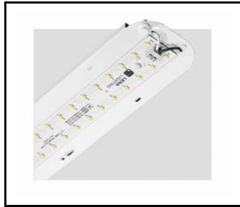
TYTAN 2 LED HALL 1150mm 8200lm 840 60D - lighting module (367106)