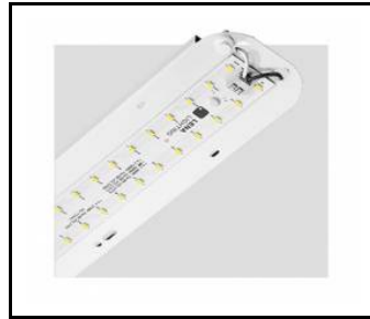
TYTAN 2 LED HALL 1150mm 8250lm 840 70D - lighting module (367113)