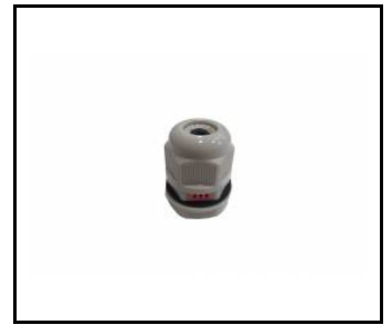
Breathable gland gray M20*1.5 IP68 (16000507)