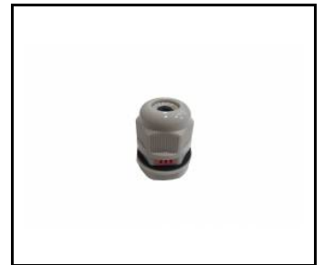
Breathable gland gray M20*1.5 IP68 (16000507)