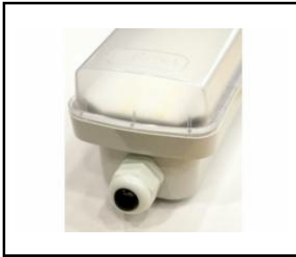
M16 stuffing box plug various PA black M-16 - BPM-21 (60000006)