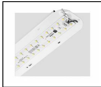
TYTAN 2 LED HALL 1150mm 8250lm 840 70D - lighting module (367113)