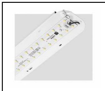
TYTAN 2 LED HALL 1450mm 10300lm 840 70D - lighting module (367236)