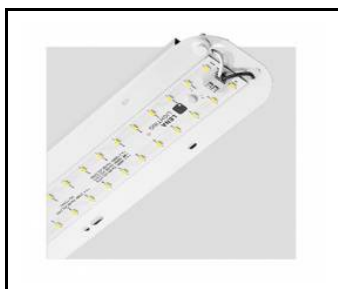
TYTAN 2 LED HALL 1450mm 10300lm 840 70D - lighting module (367236)