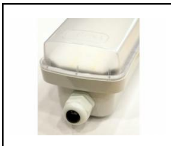
M16 stuffing box plug various PA black M-16 - BPM-21 (60000006)