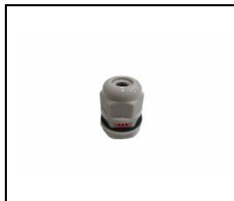
Breathable gland gray M20*1.5 IP68 (16000507)