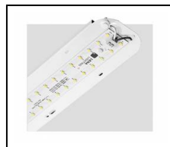
TYTAN 2 LED HALL 1150mm 8350lm 840 90D - lighting module (367120)