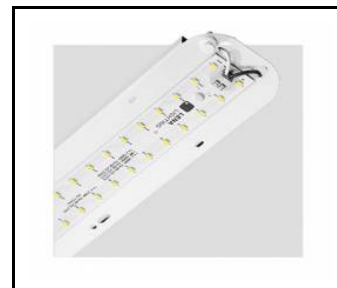
TYTAN 2 LED HALL 1150mm 8350lm 840 90D - lighting module (367120)