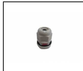
Breathable gland gray M20*1.5 IP68 (16000507)