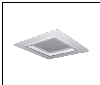
Frame square 220 for SQ160 white RAL9016 structure (998942)