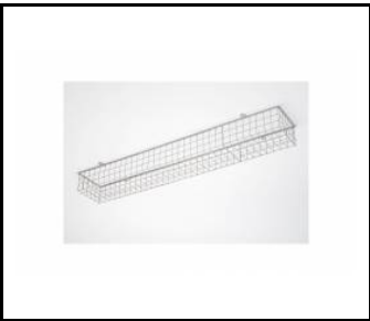
TYTAN LED. ATLAS LED - protective grid 1432mm (907920)