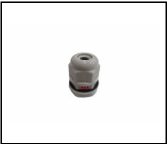
Breathable gland gray M20*1.5 IP68 (16000507)