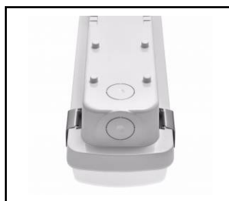
wybór miejsca zasilania / choosing a place of power supply / Stromversorgungsanschluss von mehreren Seite möglich