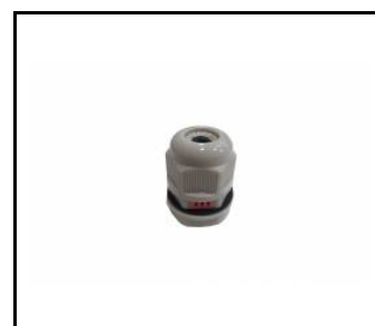
Breathable gland gray M20*1.5 IP68 (16000507)