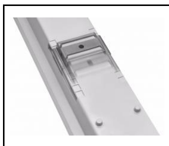
regulowane uchwyty / adjustable handles / einstellbare Halterungen