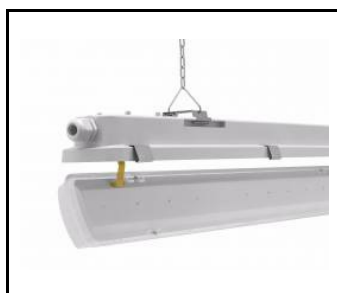
system zwieszania klosza / suspension system of the diffuser / hängende Diffusor