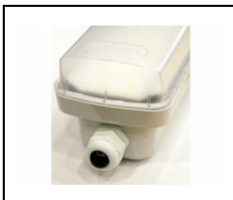
M16 stuffing box plug various PA black M-16 - BPM-21 (60000006)