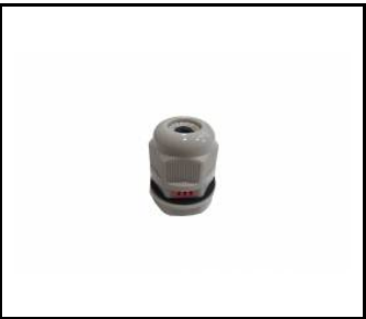
Breathable gland gray M20*1.5 IP68 (16000507)