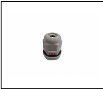
Breathable gland gray M20*1.5 IP68 (16000507)