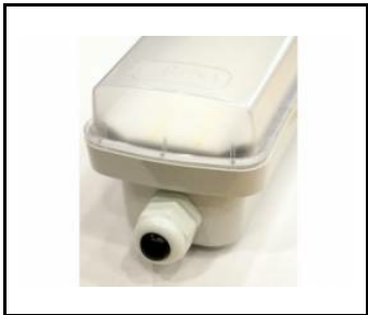
M16 stuffing box plug various PA black M-16 - BPM-21 (60000006)