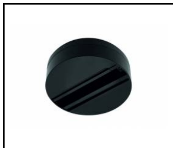
EXPO SYSTEM LED surface mounting base black (255106)