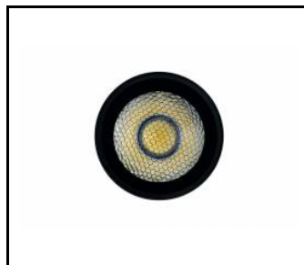
EXPO SYSTEM LED honeycomb (255120)