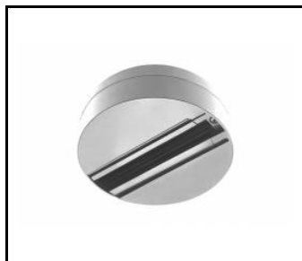
EXPO SYSTEM LED surface mounting base white (255113)