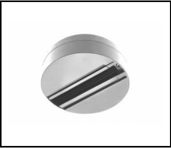
EXPO SYSTEM LED surface mounting base white (255113)