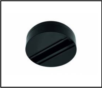
EXPO SYSTEM LED surface mounting base black (255106)