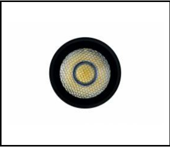
EXPO SYSTEM LED honeycomb (255120)