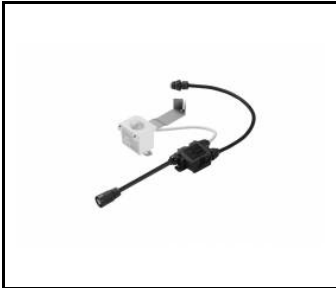
OCULUS LED MINI- PIR / RCR DALI sensor complete (967047)