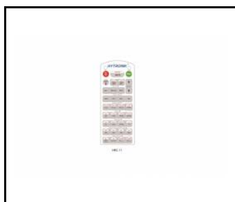
WSEL415 Remote control for - PIR sensor (WSEL415)