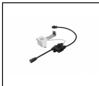
OCULUS LED MINI- PIR / RCR DALI sensor complete (967047)