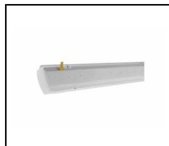
ATLAS LED 1450mm 7020lm 840 MAT - light module (657429)