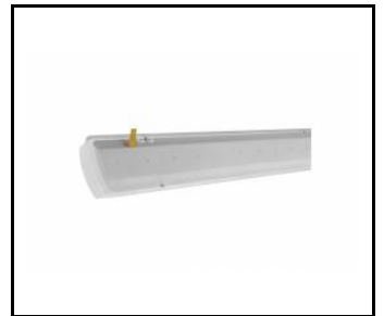
ATLAS LED 1150mm 4500lm 840 - lighting module (952029)