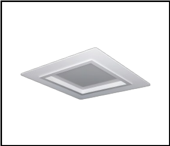
Frame square 220 for SQ160 white RAL9016 structure (998942)